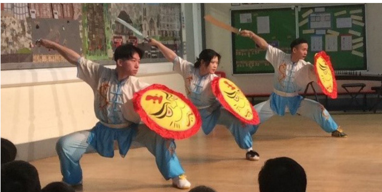
Tetherdown Primary School celebrated Chinese New Year with a display in martial arts

■ For more information about Tetherdown Primary School: tetherdownschool.org/