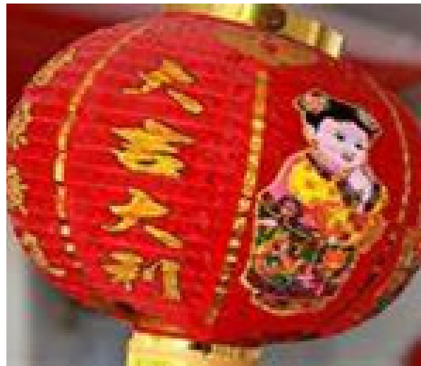
Cultural connections are made through learning Mandarin