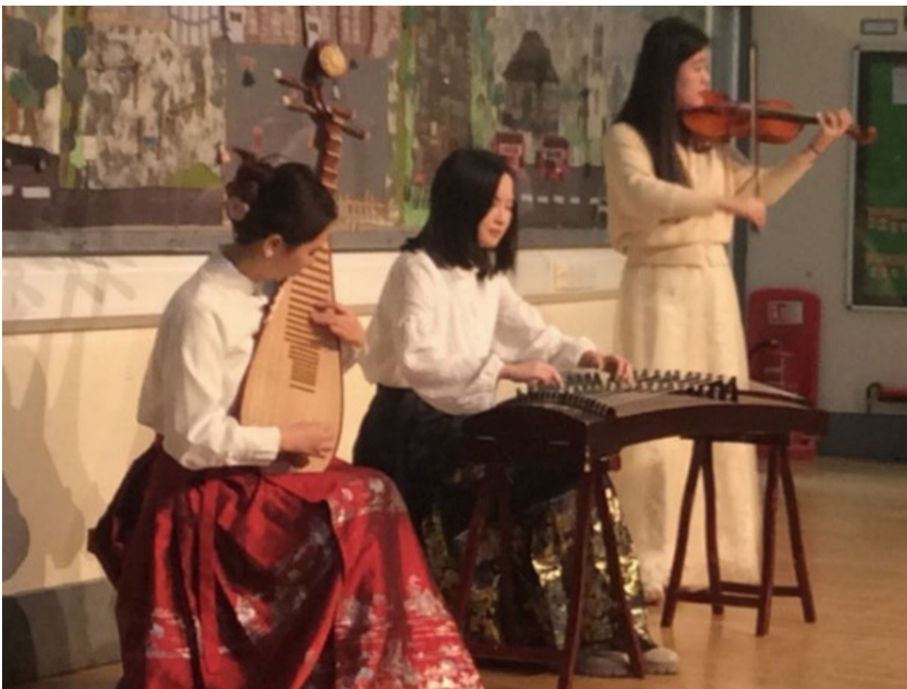
Pupils learn about the Mandarin culture through music