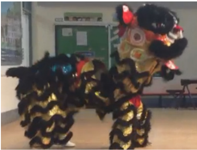
Pupils were captivated by the lion dance